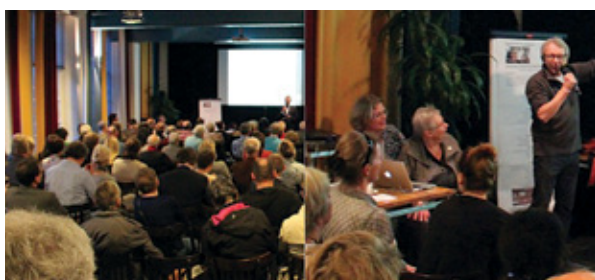
The City Council experienced a new informal setting for its meeting: a City Café to facilitate contact and exchanges with citizens.