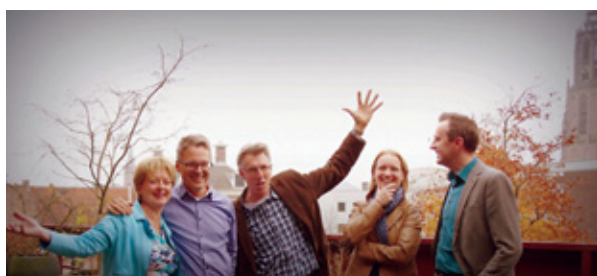
The Change Team in Amersfoort.

The city authority created a Change Team, which consisted of five people: the Advisors in Communication and Human Resources, the Head of the Social Development Department and the Finance Controller, all assisting the Town Clerk and the General Director with internal change, reorganisation and the related internal communications. For them the main goals of the change were shifting from a 'power role' to one of a 'learning administration'; fostering multidisciplinary and collaboration between the different departments; promoting transparency in public action; being less expert and more able to connect; making interdependent and integrated policies; fostering responsibility beyond silos; and learning how to learn from failures.