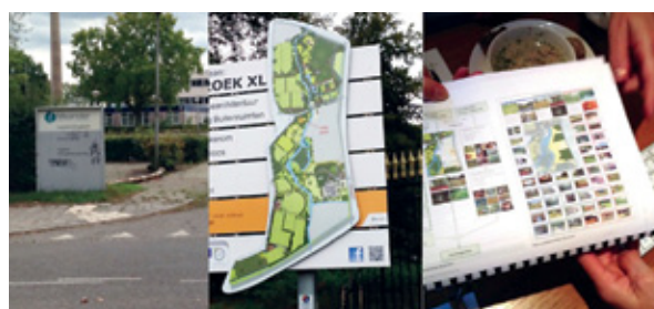
The plan of the Elisabeth Park is one of the inspiring flagship projects, self-developed by the citizens.

on their shoulders. Altogether, the citizen project group put in 1,400 hours of work (excluding the architect's time), which added up to a significant investment of voluntary effort. It performed well and developed a complete project plan for the park. General Director of Amersfoort municipality Nico Kamphorst acknowledges: "The process was quicker, less expensive and achieved a wider consultation than when normally done by the municipality."